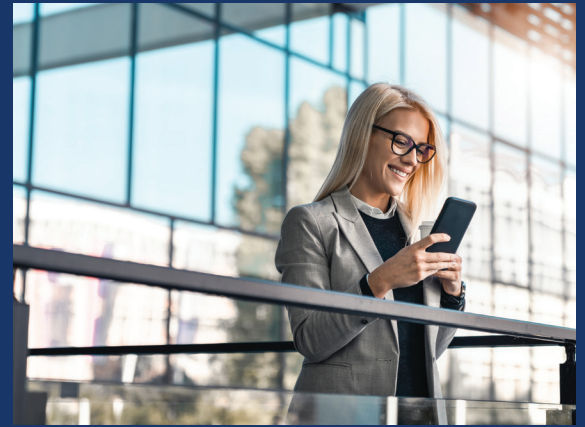
SL2 helps Financial Advisors to compliantly engage with Clients when and where they feel most comfortable by separating personal and business activity on the same smartphone

Together, CellTrust and BlackBerry® deliver a complete mobility solution for enterprises to holistically take control of their devices, applications and mobile communications. This plan features SL2 secured by BlackBerry® license SMS with a US phone number (MBN – Mobile Business Number) for text messaging (SMS/MMS), the secured by BlackBerry® license for BlackBerry® UEM containerization and integration with BlackBerry® UEM contacts and Microsoft 365 Exchange contacts. Group Conversation and CellTrust Container Services are included.