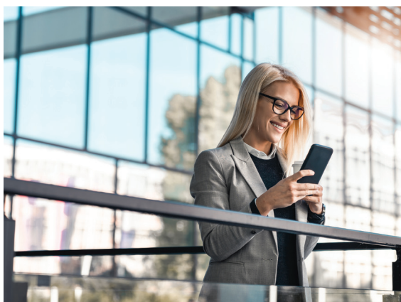
SL2 helps Financial Advisors to compliantly engage with Clients when and where they feel most comfortable by separating personal and business activity on the same smartphone

CellTrust supports customers with domestic and international phone numbers on the same phone that all ring globally, with messaging capability across the world (where available).