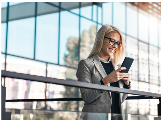
SL2 helps Financial Advisors to compliantly engage with Clients when and where they feel most comfortable by separating personal and business activity on the same smartphone

CellTrust supports customers with domestic and international phone numbers on the same phone that all ring globally, with messaging capability across the world (where available).