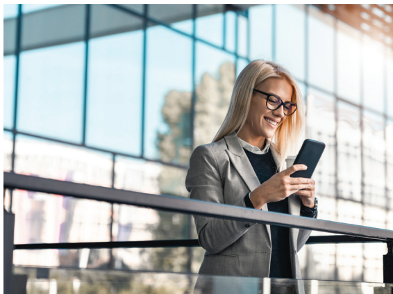
SL2 helps Financial Advisors to compliantly engage with Clients when and where they feel most comfortable by separating personal and business activity on the same smartphone

CellTrust supports customers with domestic and international phone numbers on the same phone that all ring globally, with messaging capability across the world (where available). VOIP and messaging is encrypted for internal communication with no variable costs; external communications are traced, logged and can be archived.