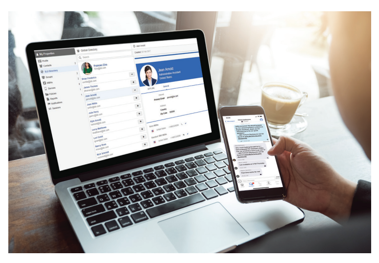
Communications can be synced on multiple devices so financial advisors can start a conversation in their SL2 mobile app and continue that conversation from the SL2 web portal when they get to the office.

SL2 supports sending, receiving, and capturing text communications, images, files, and WhatsApp communications. The varying conversation types, such as True Group Messaging, dispatch announcements, and scheduled messages, help to give your users the tools they need to communicate efficiently. In addition, advisors can set up automatic replies for out-of-office text responses or configure their own messaging templates to select and send commonly used messages.