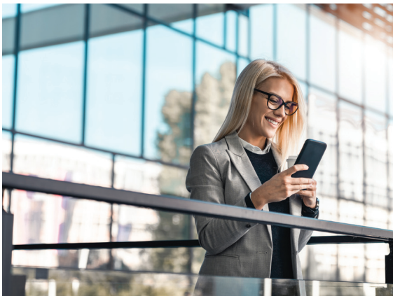
SL2 helps Financial Advisors to compliantly engage with Clients when and where they feel most comfortable by separating personal and business activity on the same smartphone

CellTrust supports customers with domestic and international phone numbers on the same phone that all ring globally, with messaging capability across the world (where available).