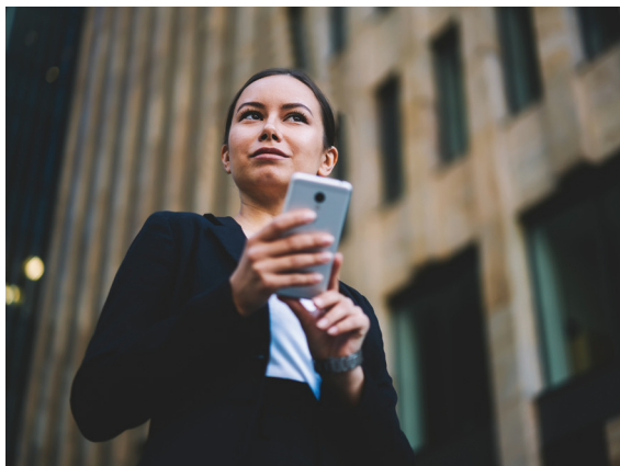
SL2 delivers a traceable and seamless Advisor-Client experience on one Mobile Business Number - in the office and on the go

All calls received on the landline telephone number are directed to the existing phone service provider and can be forwarded to the Advisor's Smartphone depending on whether the Advisor is in the office or on the go. When an Advisor makes a phone call from their SL2 mobile app - the caller ID is that of the landline. This feature helps to maximize the return on your existing landline infrastructure investment, drives Advisor productivity and protects Client continuity by providing them with one MBN which always remains with your organization for calling, texting or chatting.